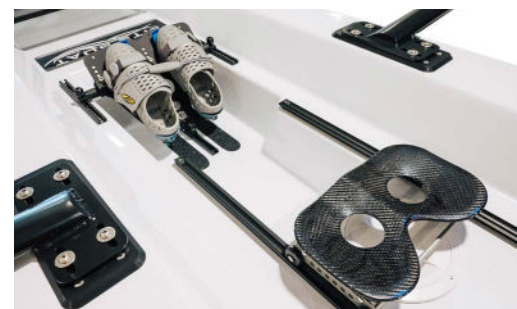
Adjustable carbon seats & active tool shoes