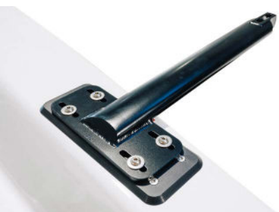
Fixed anodized half-riggers

• Direction: the daggerboard and rudder can be raised by the cox.