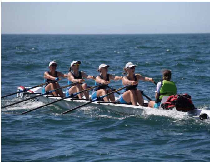
World Coastal Championships - Portugal