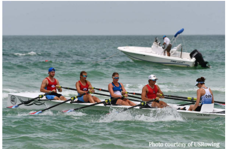
Beach Sprints - US Rowing National Team