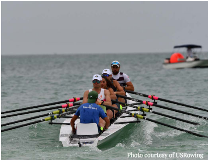
Beach Sprints - US Rowing National Team