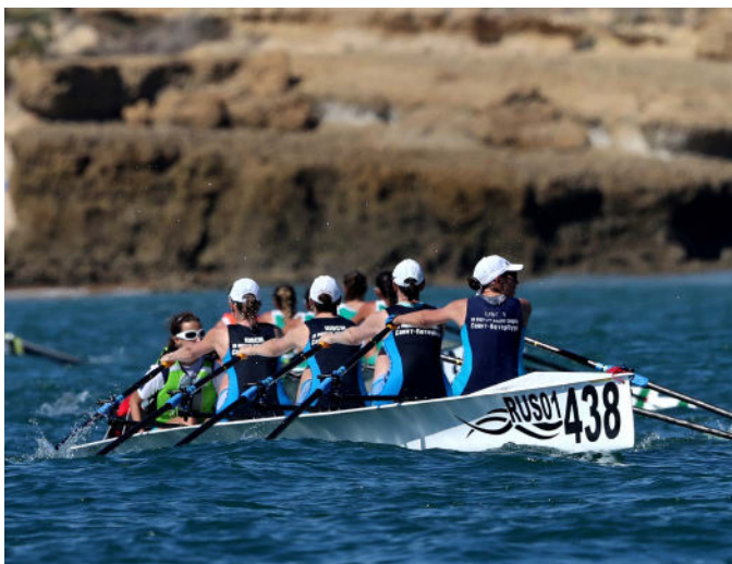
World Coastal Championships - Portugal