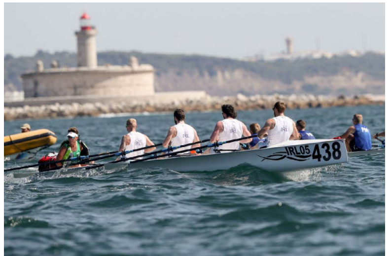
World Coastal Championships - Portugal