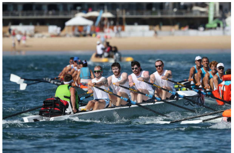
World Coastal Championships - Portugal