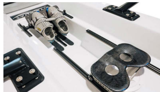
Adjustable carbon seats & active tools shoes