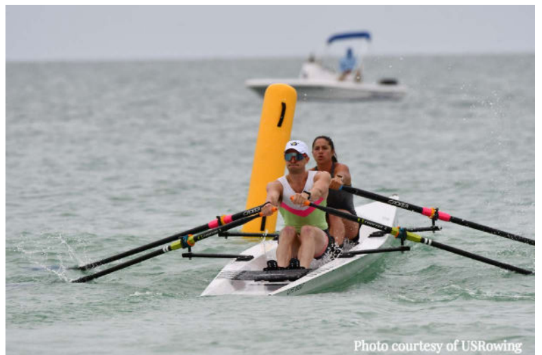
Beach Sprints - US Rowing National Team