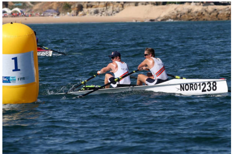
World Coastal Championships - Portugal