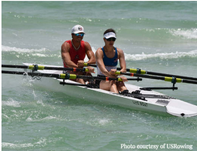
Beach Sprints - US Rowing National Team