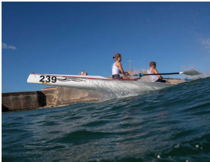
World Coastal Championships - Portugal