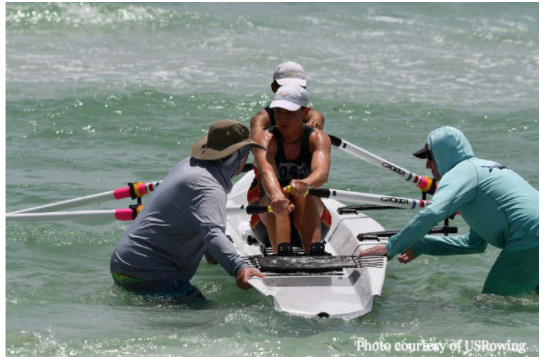
Beach Sprints - US Rowing National Team