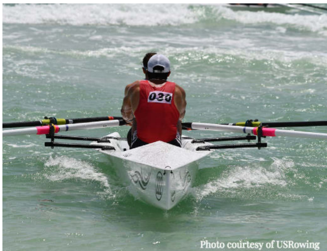
Beach Sprints - US Rowing National Team