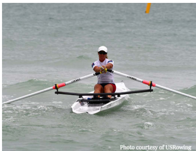
Beach Sprints - US Rowing National Team