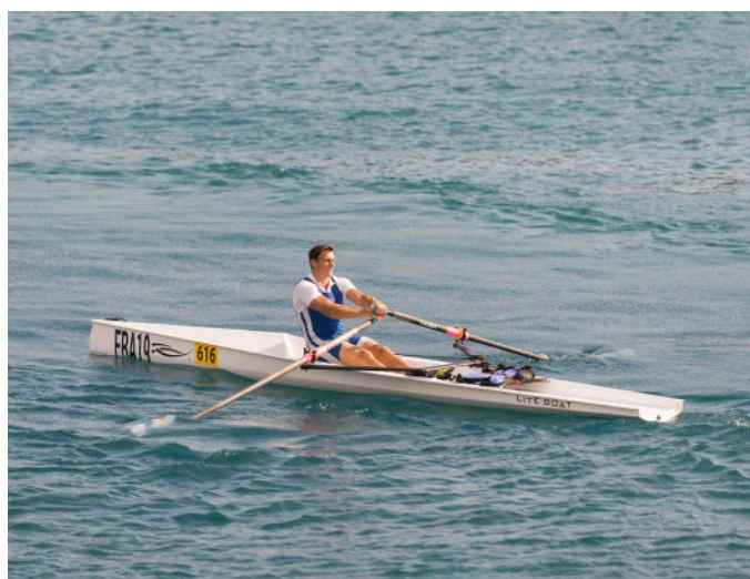
Albert II Coastal Rowing Regatta - Monaco