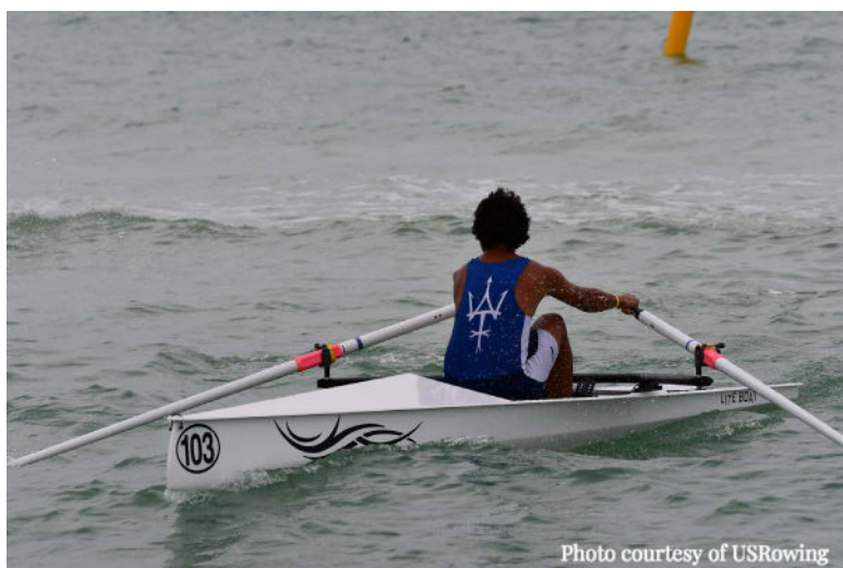
Beach Sprints - US Rowing National Team