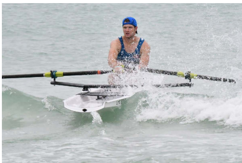
Beach Sprints - US Rowing National Team