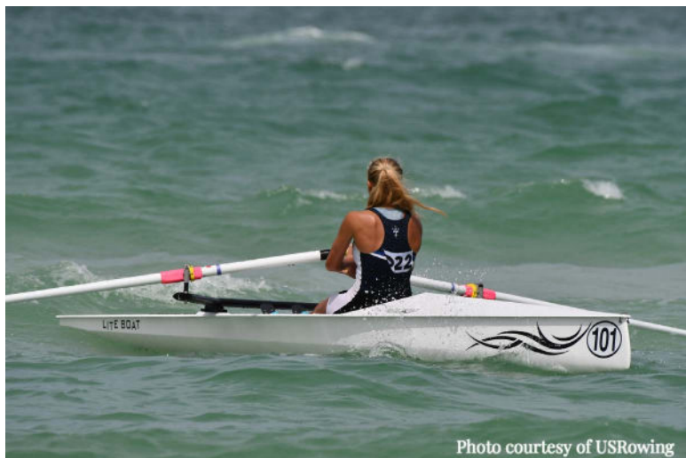
Beach Sprints - US Rowing National Team