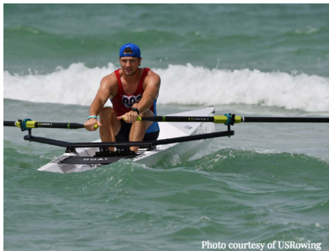
Beach Sprints - US Rowing National Team