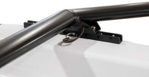
Quick-release system for the rigger