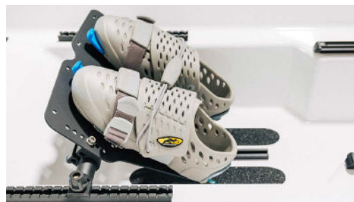
Active tools adjustable shoes