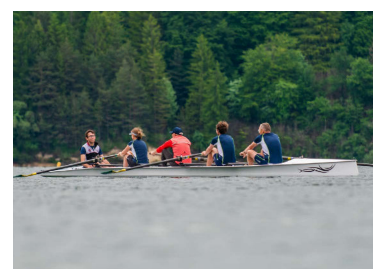
Sweep rowing configuration