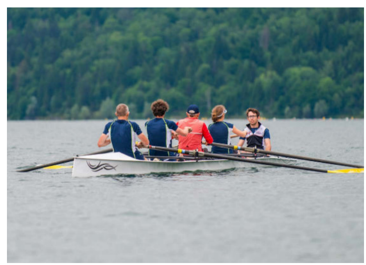
Sweep rowing configuration