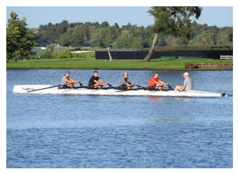
Sweep rowing configuration