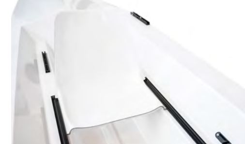
Quick-release scull/sweep rowing riggers