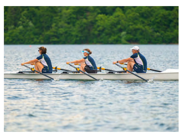
Three rowers sculling