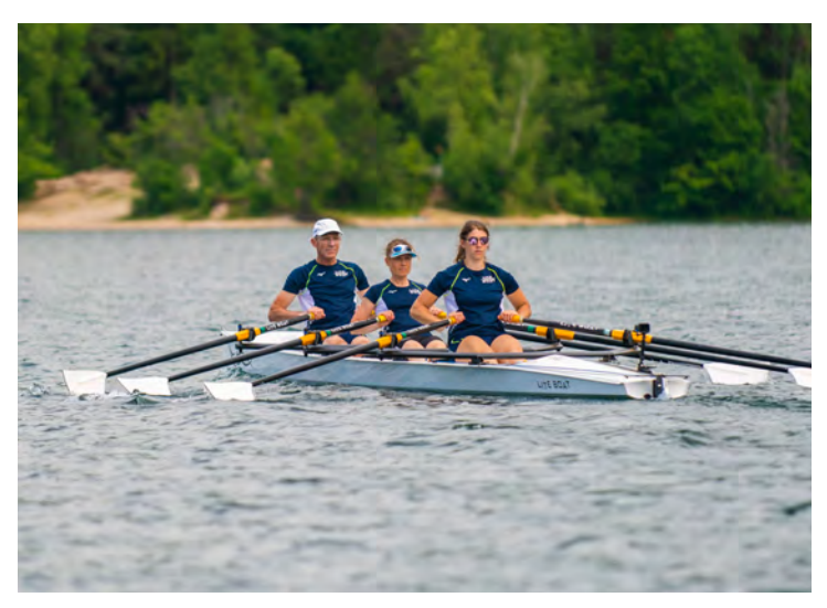
Three rowers sculling