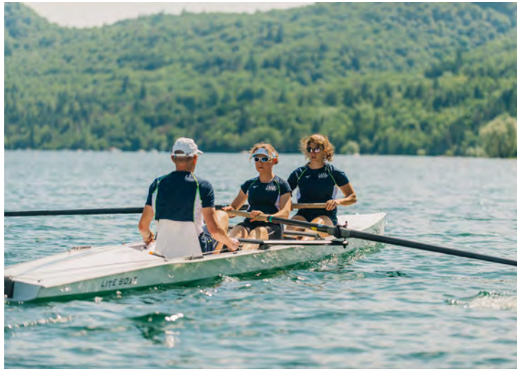
Two rowers in sweep rowing + cox