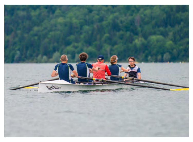
Sweep rowing configuration