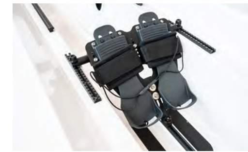
Quick-release scull/sweep rowing riggers