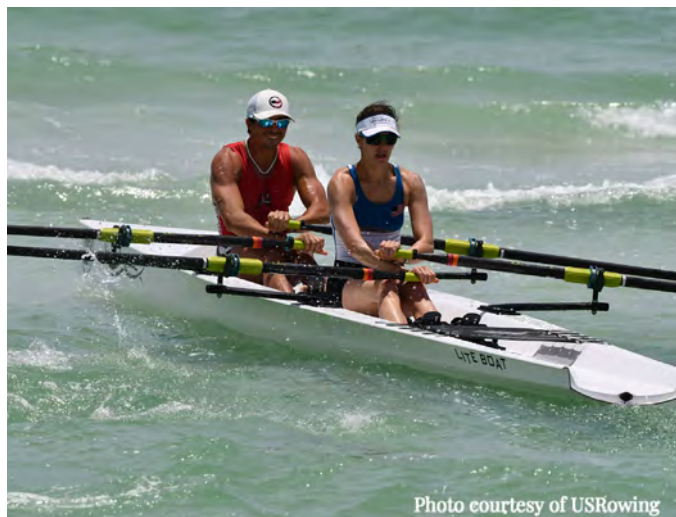
Beach Sprints - US Rowing National Team