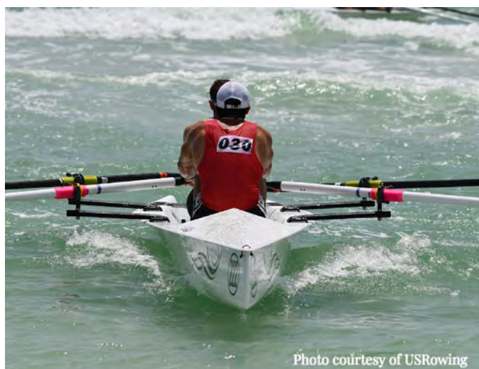
Beach Sprints - US Rowing National Team