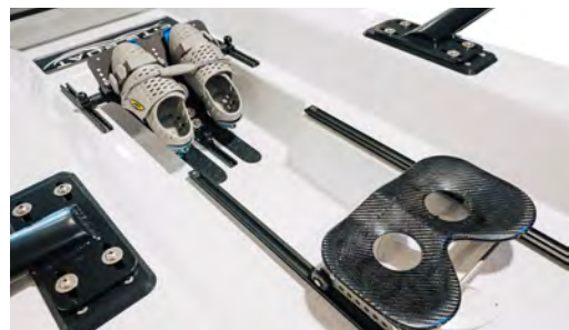
Adjustable carbon seats & active tools shoes