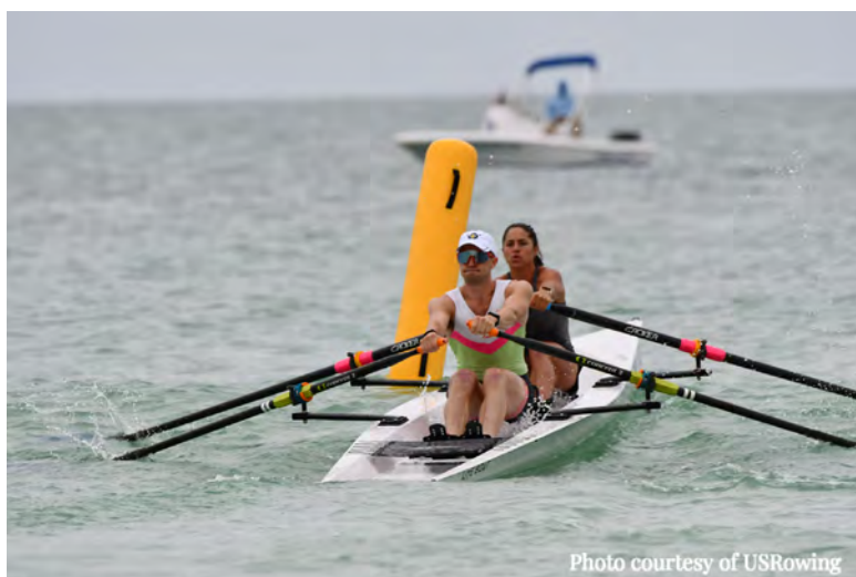
Beach Sprints - US Rowing National Team