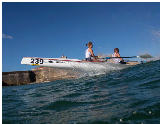
World Coastal Championships - Portugal