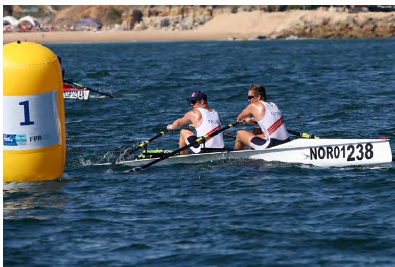
World Coastal Championships - Portugal