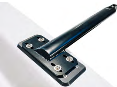
Fixed anodized half-riggers