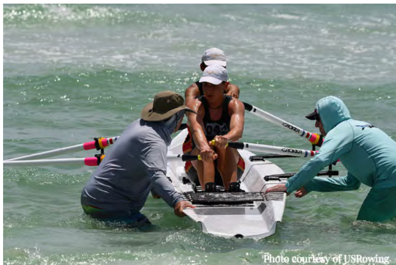
Beach Sprints - US Rowing National Team